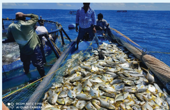
Sea cage culture of Cobia and Indian Pompano at Palk Bay, TN and Vizag, AP with technical guidance of CMFRI and Financial assistance of NFDB